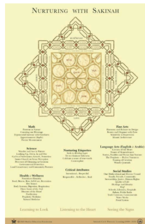
Figure 3. Theme “Nurturing with Sakinah”

In the theme “Nurturing with Sakinah” carried out by Sakinah Circle, learning is directed to educate students to develop spiritual, intellectual, and emotional awareness that is integrated with the Qur’anic worldview. This theme aims to cultivate natural nature in students by focusing on core values such as compassion, balance, and respect for creation 56 .